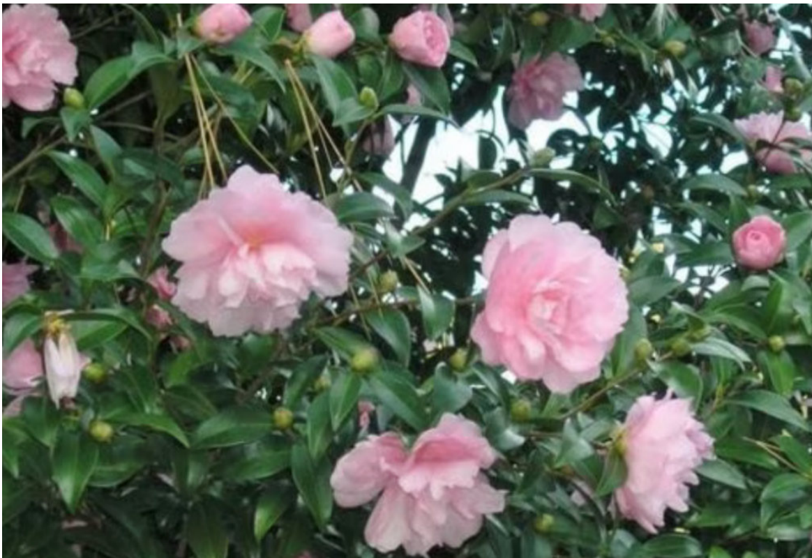
Sasanqua 'Cotton Candy'