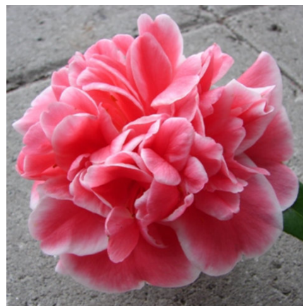
Camellia ‘Walker Lewis’