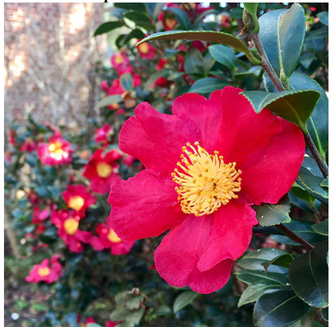
Camellia Sasanqua 'Yuletide'

Sasanqua camellias are the first to come in to bloom in the season with their smaller petals, they usually bloom almost all at once and put on quite a show.